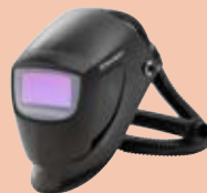
Speedglas 9000 Welding Shield approved for use with 3M Dustmaster or 3M Jupiter.